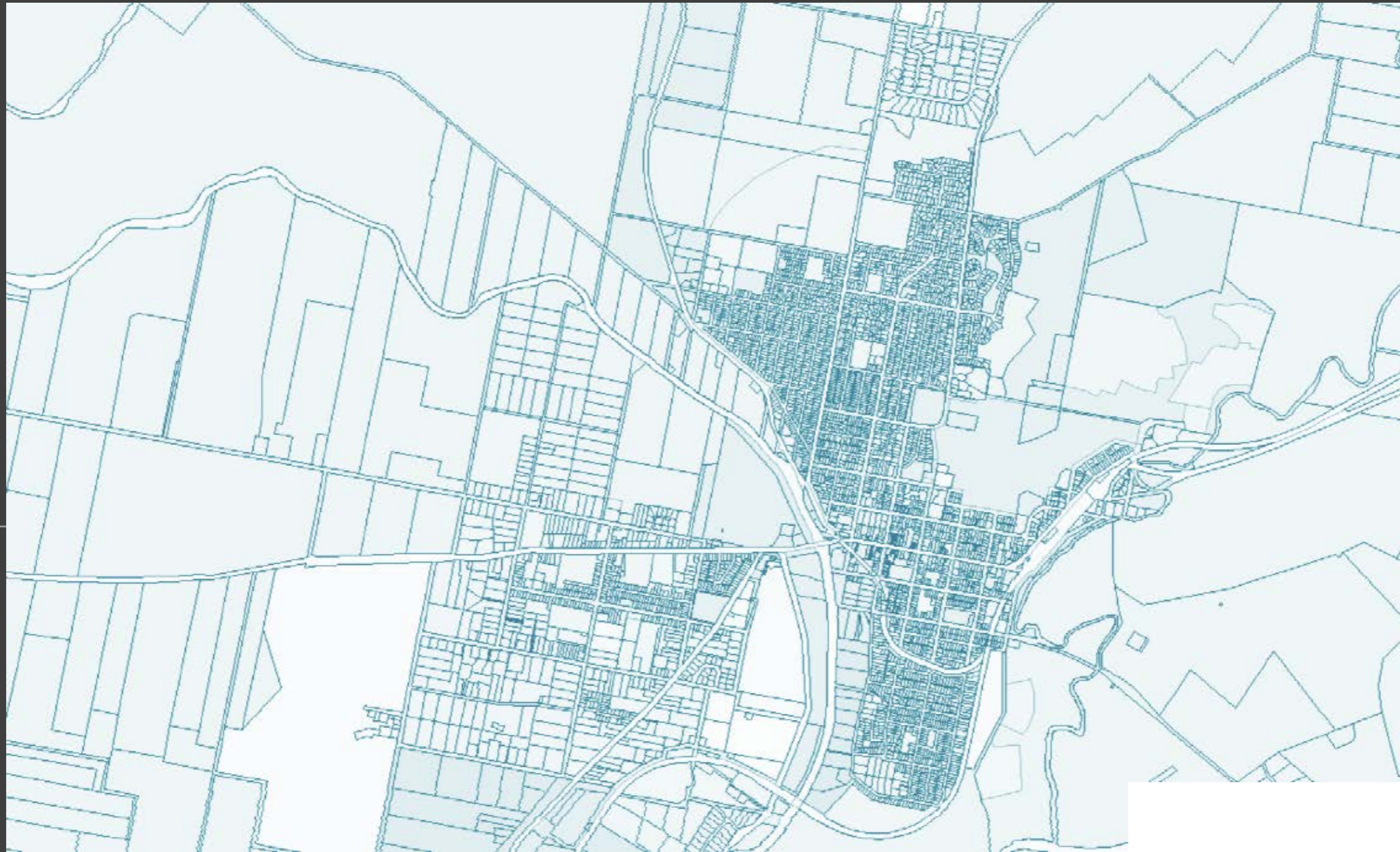
COWRA LEP 2012 map